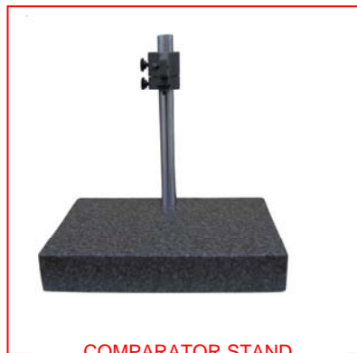
COMPARATOR STAND OPTIONAL HOLE LOCATION