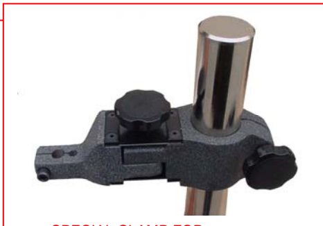
SPECIAL CLAMP FOR DROP INDICATOR STEM MOUNT